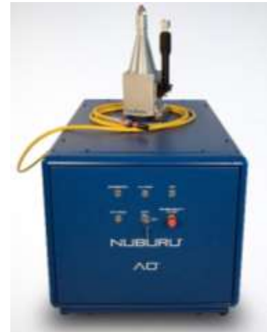
Figure 2. AO-650, BlueWeld 100