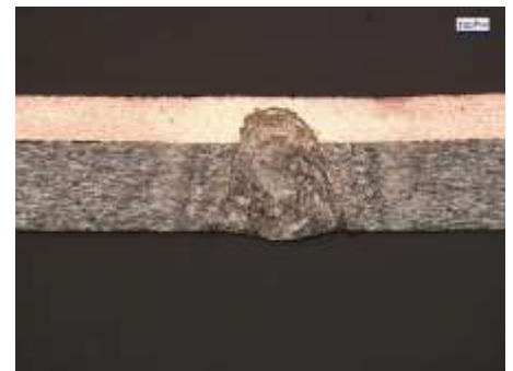
Figure 3. 300µm Steel Can to 2x80µm