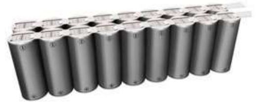
Figure 1. Cylindrical Cell Pack

NUBURU's blue laser provides the necessary coupling efficiency that generates a controllable process with an easier approach of welding. This process limits the need for part contact and complex weld parameters, a clear advantage over current methods.